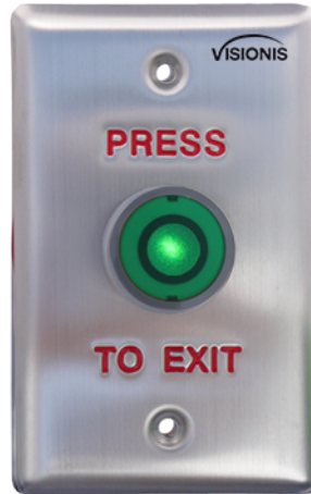
With Light ON