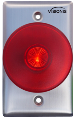
With Light ON