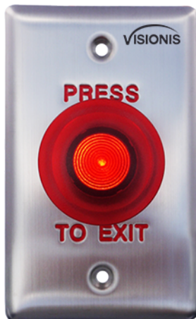
With Light ON